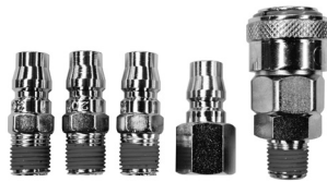
5 PIECE PACK - HIGH-FLOW AIR FITTINGS 1/4" BSPT ORDER CODE F935